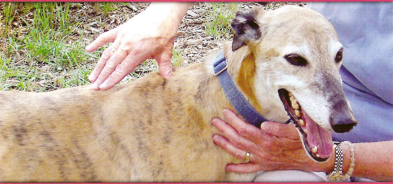
Using the thumb method during a treatment.

I t was late in the evening and time to get ready for bed. Spencer, our six-year old greyhound, trooped out to the backyard with our three other dogs to take care of business. The other dogs bounced back into the house as usual after a few minutes, but Spencer was not with them.